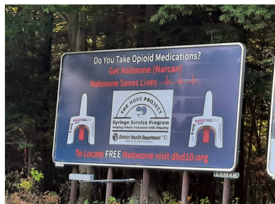
IMAGES OF BILLBOARDS IN THE COMMUNITY